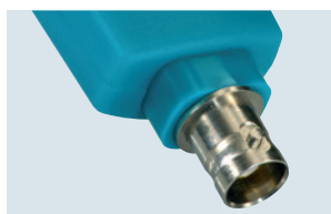
testo 206-pH3: pH3 probe head with BNC interface