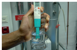
Ideally suitable for monitoring heating system water according to VDI 2035.