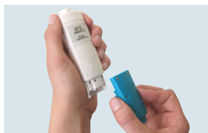
Easy exchange of probes with testo 206-pH1/-pH2/-pH3