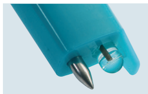
testo 206-pH1: pH1 probe head for liquids